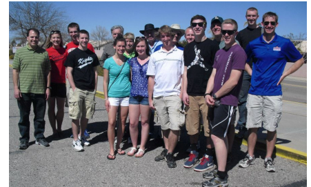
March 2 Canvassing Group